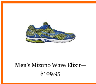
Men's Mizuno Wave Elixir—$109.95