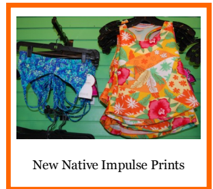
New Native Impulse Prints